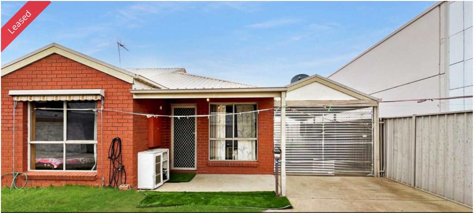
Unit 1, 89A High St, Cobram