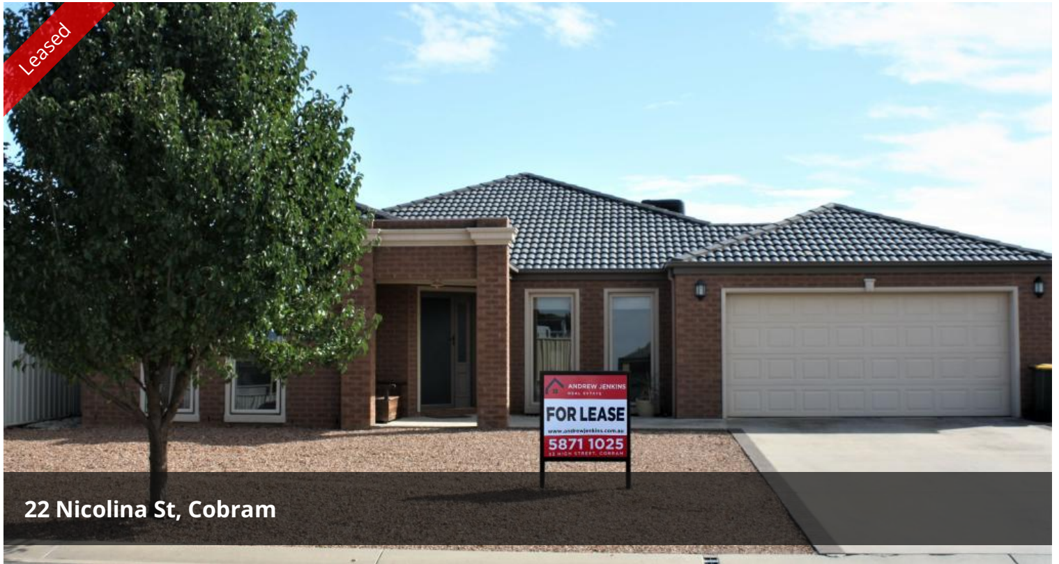
22 Nicolina St, Cobram