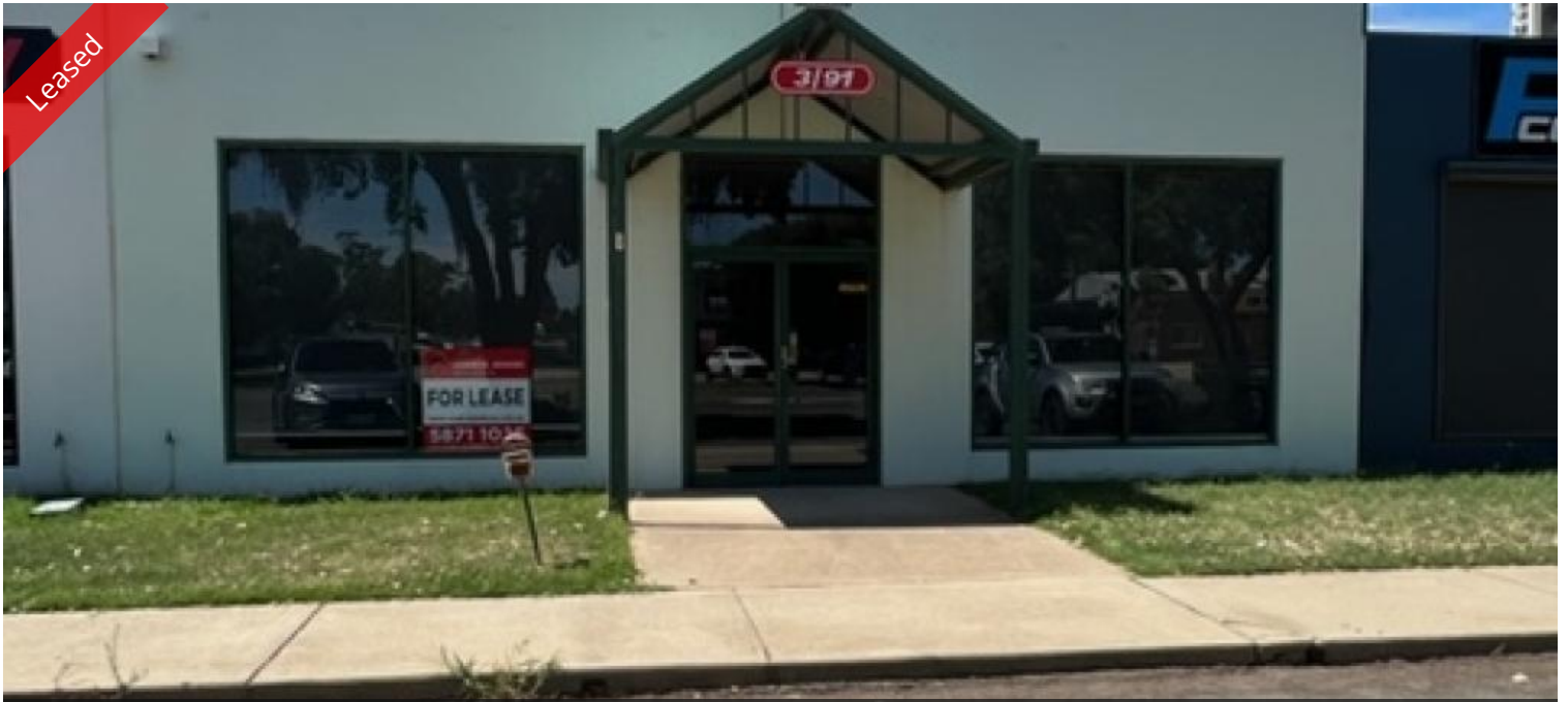
Shop 3, 91 Broadway Street, Cobram