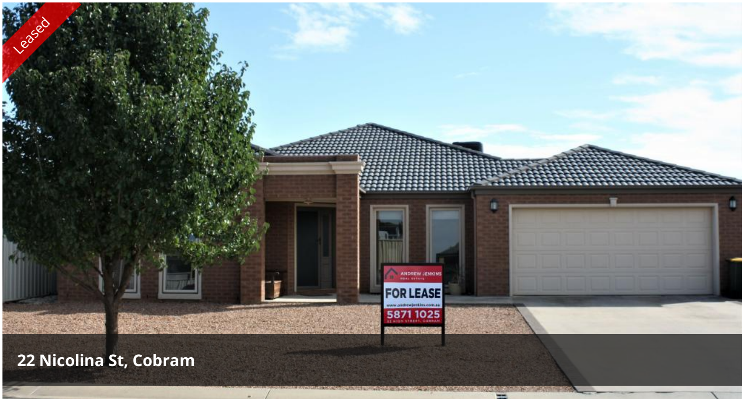
22 Nicolina St, Cobram