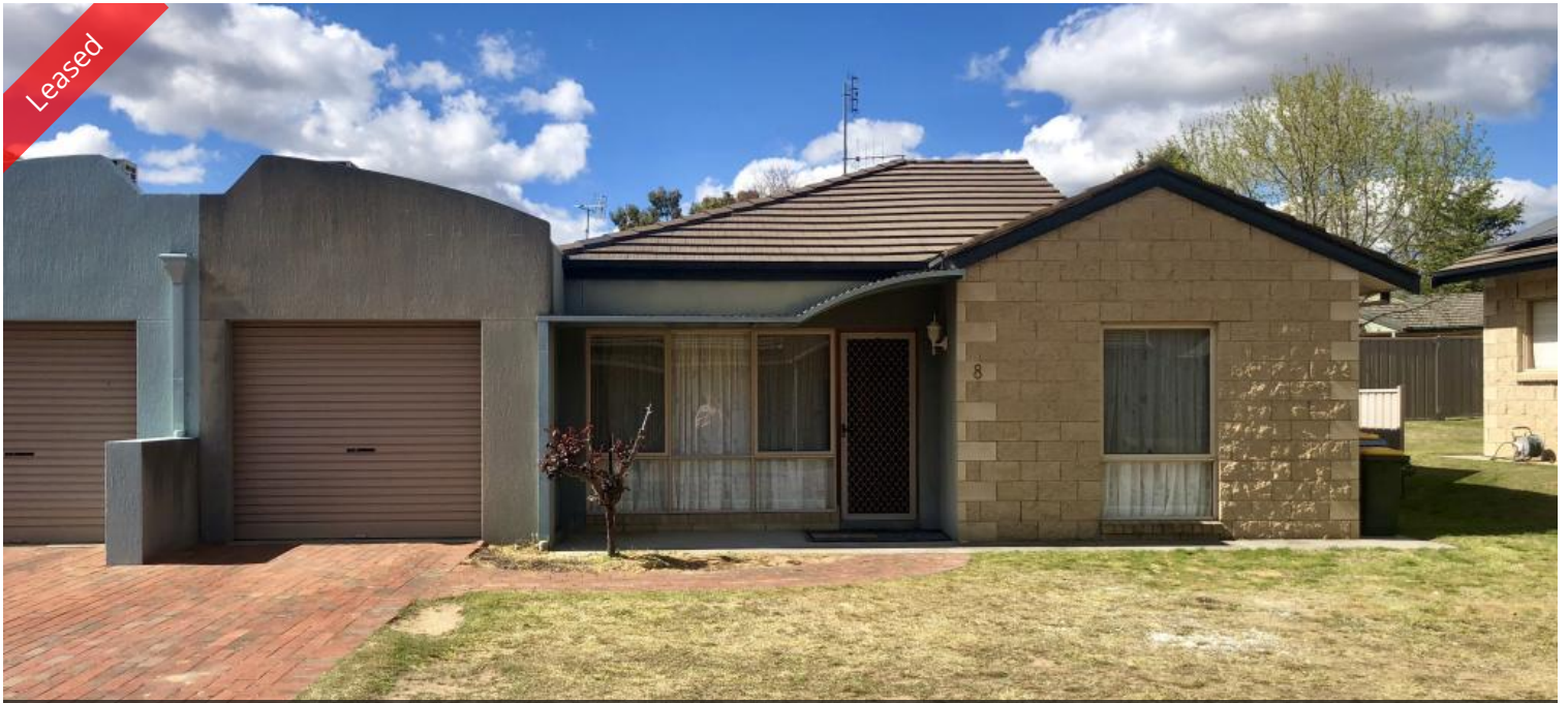
Unit 8, 45-47 Golf Course Rd, Barooga