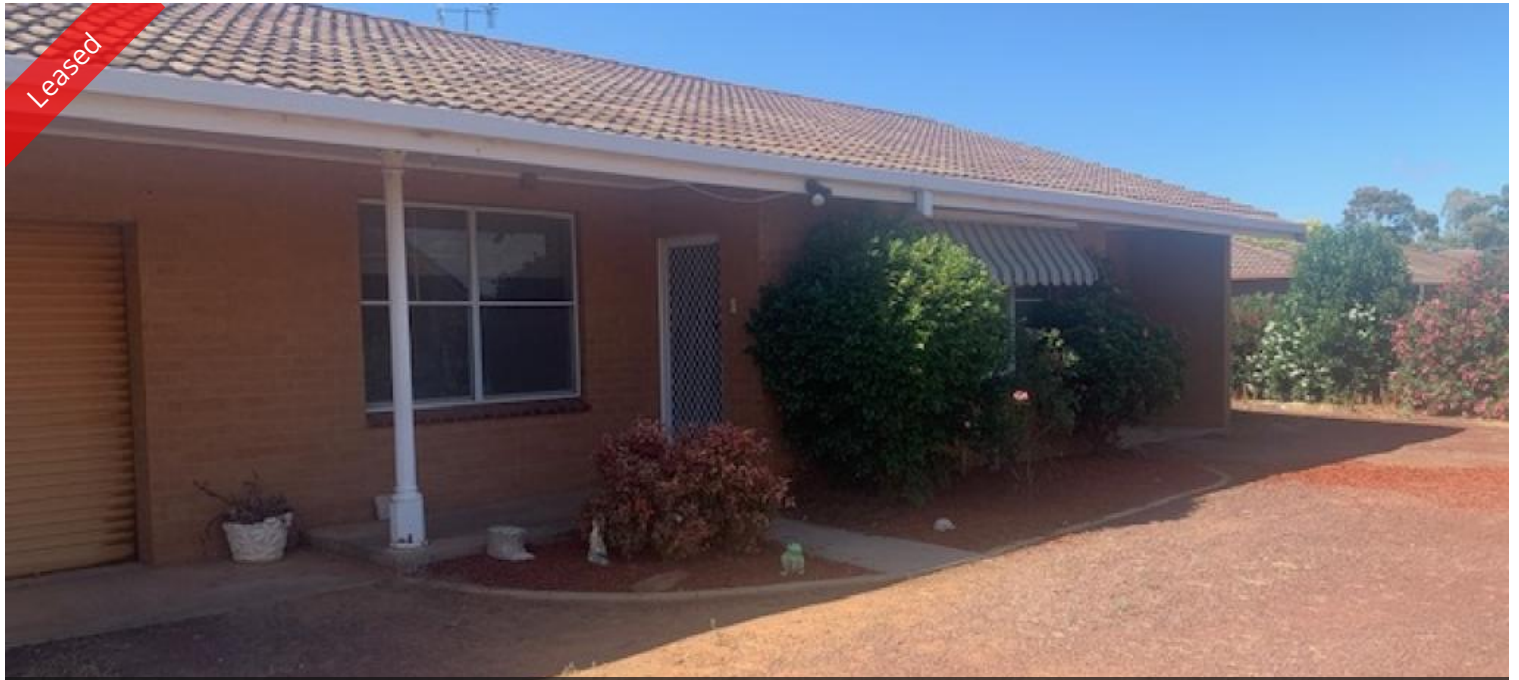
Unit 2, 1-2 Margaret Ct, Cobram