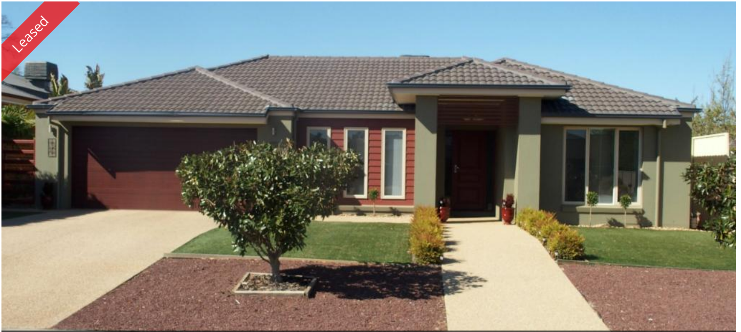
7 Alexander Court, Cobram