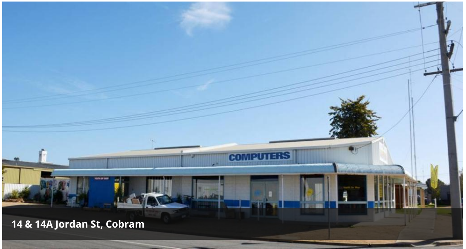
14 & 14A Jordan St, Cobram