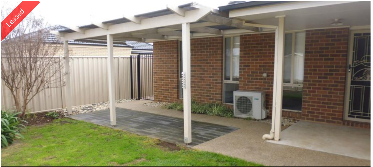
Unit 2, 7 - 9 Sledmere Avenue, Cobram