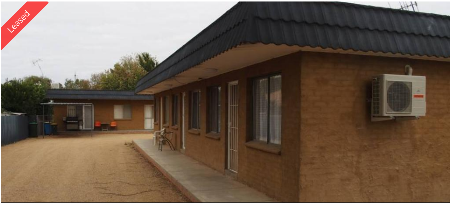
Unit, 2/16 Mookarii Street, Cobram